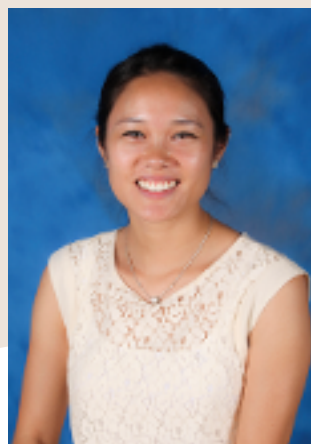
B.A., M.Ed., UC San Diego Credentialed